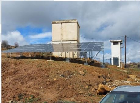
Solar panels installed – Hadath Jebbi (North) Serves 4000 individuals

Install a solar system to operate the water pumping stations to provide continuous water supply