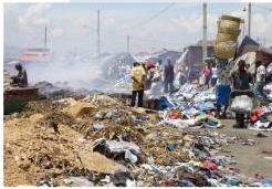
Solid waste management