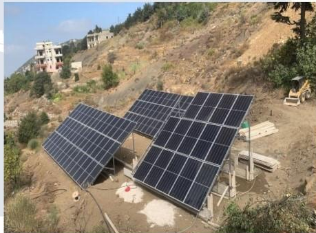
Solar panels installed - Beit Al Faqs (North) Serves 400 HH