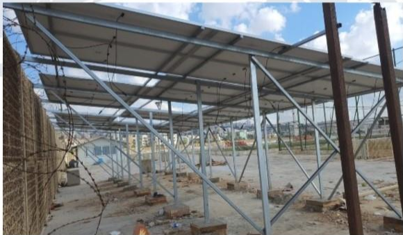
Solar panels installed – Saida Stadium

Install a solar system to generate electricity to light the grounds and the WASH facilities of Saida stadium