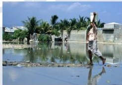
WASH in diseases outbreaks